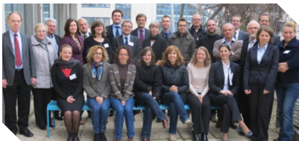
Kick-off-Meeting of EuroNanoMed II in Paris

Swiss National Science Foundation (SNSF), Switzerland